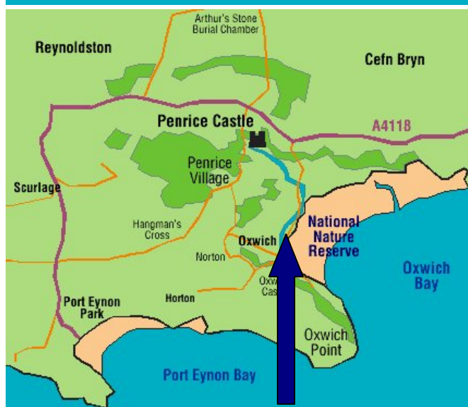
Oxwich Bay – Watersports 4 All